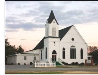
March 12, 2025

Coffee & Doughnuts - 8:00 am Contemporary Service 8:30am Sunday School - 10am Traditional Service - 10:45am Tues. Ladies Bible Study - 10:00am Wed. Discipleship Groups, Youth Group, & Bible Study @ 7:00 PM Thurs. Benj's Bible Study @ 6pm