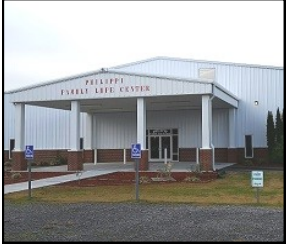
Vol. 56, Issue 6